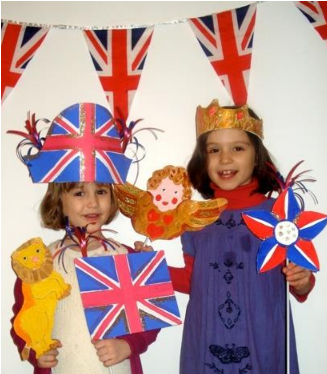
Children's 1950's Make and Take Home and Coronation Workshop

The workshops can deal with up to 240 children per day, each one making something to take home.