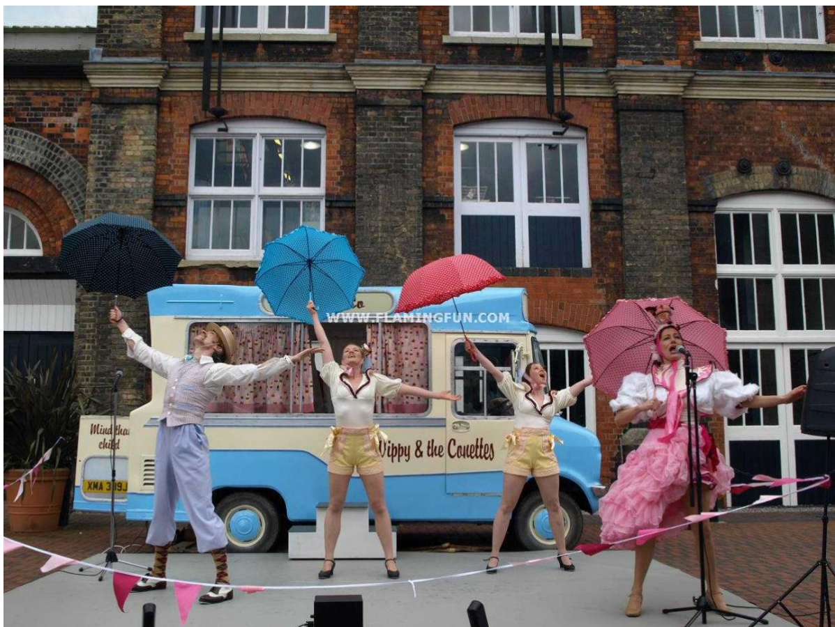
Mr Wippy and the Conettes

Mr Wippy and the Conettes is a piece of mobile, musical theatre based in an antique ice cream van. The styling is reminiscent of 1940's American 'Cheesecake' art and the saucy seaside postcard art of pre-war Britain, tailored to suit family audiences. The theme of the show is ice cream and it is 15mins long. The characters: Mr. Wippy - the compère and crooner, Knickerbocker Glory (AKA Strawberry Sauce) the leading lady and The Conettes- the two backing singers, all sing and dance familiar Hollywood musical numbers with rewritten lyrics. Between shows the cast offer short dance workshops to members of the audience, all ages are welcome.