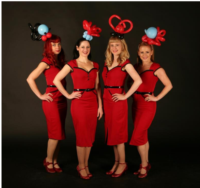
1950's Inflate-A-Bells - Pop Up Balloon Boutique