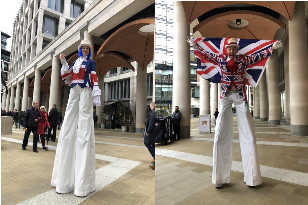
Union Jack Stilt Walkers

Mixing comedy and conversation, stilt walkers characters engage audiences in a novel way. Perfect for the Coronation of Charles III. 3 x 45 min performance sets